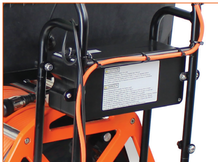
Battery Pack in holder

No need to rely on vehicle or mains power. Minicam's unique ProteusPower Pack enables pipeline inspections in the most remote locations with in excess of 5 hours of inspection time.